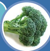
Table 2. Examples of Food Sources of Folate and Folic Acid.

Folate is found in foods such as leafy green vegetables, cooked dry edible beans, broccoli, peanuts, citrus fruit and others. Surprisingly, folic acid added to foods and vitamin pills is easier for the body to use than the folate naturally occurring in foods.