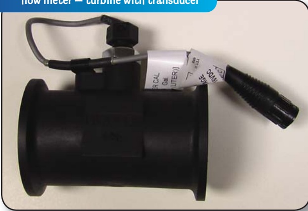
flow meter — turbine with transducer

The flow meter is installed inline after the material leaves the thermal transfer unit to measure the amount of liquid ammonia that is flowing to the soil injection knives. An electrical connection from the flow meter is used to signal the constant flow rate to the in-cab controller. The flow rate is information required to change and control the rate for variable-rate application. Several kinds of flow meters are available for use with variable-rate equipment.