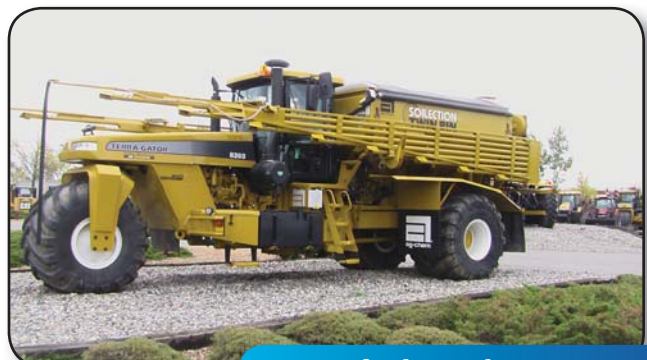
air-type fertilizer applicator

Air-type fertilizer spreaders use a variable-rate electric or hydraulic motor to adjust the speed of the feeding screw conveyor.