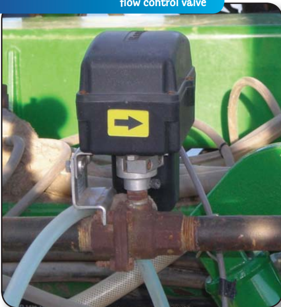
flow control valve

Variability among injectors can be minimized by keeping the anhydrous ammonia in liquid form and using high-quality distribution manifold and equal-length hoses to each injector. If hoses are not equal in length, the injectors closest to the distribution manifold will receive more anhydrous ammonia than the injectors farther from the manifold. Another problem can occur when operating on side hills. If one end of the applicator is higher than the other, the low end may receive more anhydrous ammonia than the higher end because of the effects of gravity.