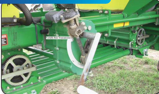
variable rate transmission on air seeder

The use of ammonia at seeding time usually will require placing the ammonia at least 3 inches from the seed row. Usually the ammonia will need to be placed below and to the side of the seed row to obtain this distance.