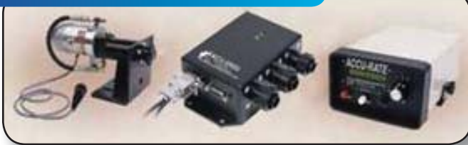
variable rate motor, control valve and rate controller

The variable-speed hydraulic or electric motor changes the fertilizer application rate by adjusting the metering system, which is a screw conveyor, metering chain or conveyor belt. These units need to be calibrated for specific fertilizer blends because nitrogen, phosphorus and potash have different densities and flow rates.