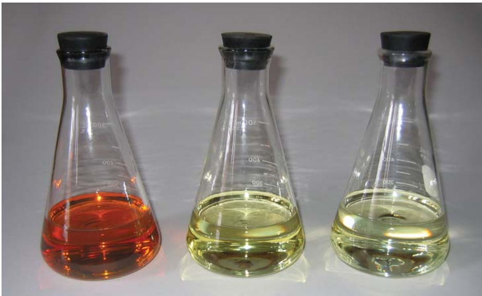
One hundred percent biodiesel (B100), center, and 100 percent soybean oil, right, are similar in color but very different in viscosity. Both differ in color from No. 2 diesel fuel, left.

with biodiesel did not cause any unusual wear of aluminum, iron, chromium and lead components. Biodiesel appears to have an engine wear rate similar to diesel fuel.