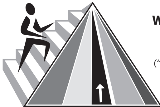
Fruit Group Focus on fruits

USDA is an equal opportunity provider and employer.